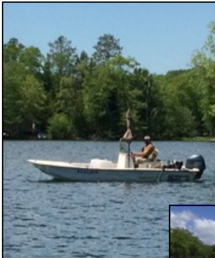
Chemical treatment for EWM June 2017.