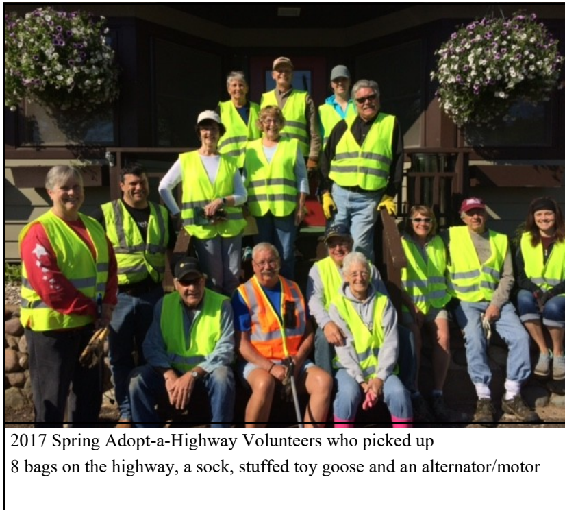
2017 Spring Adopt-a-Highway Volunteers who picked up 8 bags on the highway, a sock, stuffed toy goose and an alternator/motor