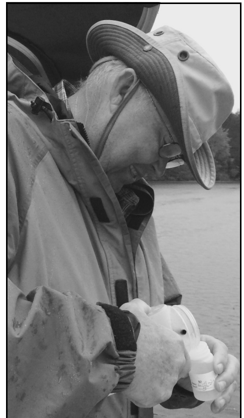
Al Bochler collecting water samples that will be sent to Madison for testing of the concentration of the herbicide post lake treatment. 120 samples over the next months period will be collected.