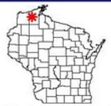
Project Location in Wisconsin

Map Date: January 8, 2014 File Name: PCLn_2014_EWM_Cond1.mxd